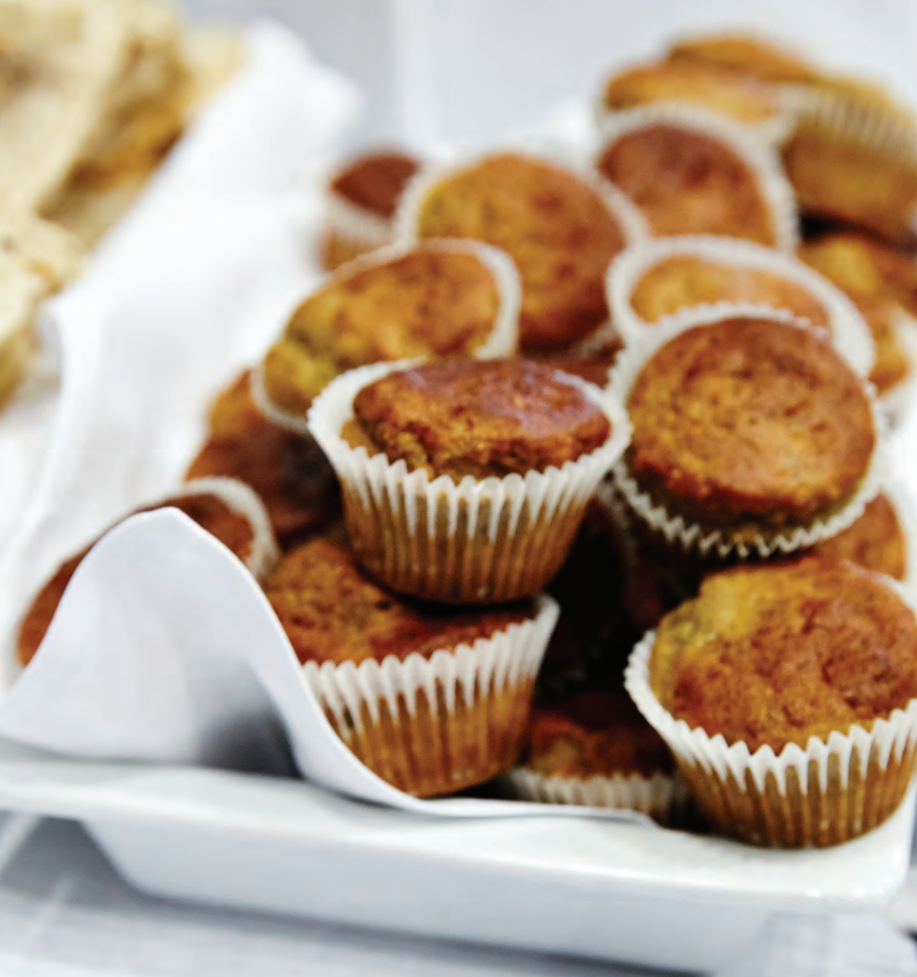
Banana bran muffin (low sugar)